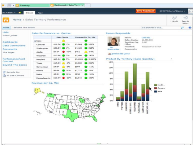
The Team Dashboard in SharePoint 2010 provides a highly visual view of your data.